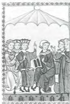
The academic gowns and hoods worn by graduates and University staff today are fashioned on everyday medieval garments.

In the Middle Ages the corporate existence of universities was recognised and sanctioned by civil or ecclesiastical authority. The regalia worn by graduates and university staff today reflect this mix of medieval governance. Robes worn by the Chancellor resemble those worn by the Lord Chancellor of England. Graduates and academic staff wear gowns similar to the dress of medieval clergy. Hoods are also fashioned on an everyday medieval garment, although the coloured lining was a later addition to indicate the wearer's university and degree.