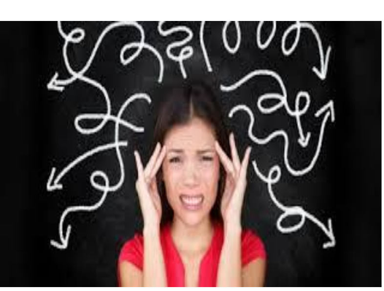
Inconclusive = Results Contradiction = Across and within studies Diversity in terminology = Unhelpful Divergence = Between cultural and economic threat theories

Limitations of research = Methodology allows for bias and subjectivity Future research = Can we consider Social Construction theory please!